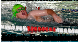
swims freestyle during the girls' 11-12 100 yd. individual medley