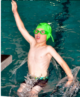
swims butterfly during the girls' 11-12 100 yd. individual medley