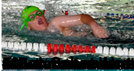
starts the girls' 11-12 100 yd. individual medley with a 25 yd. freestyle stroke