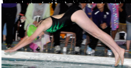
swims freestyle during the 15-18 200 yd. mixed gender relay