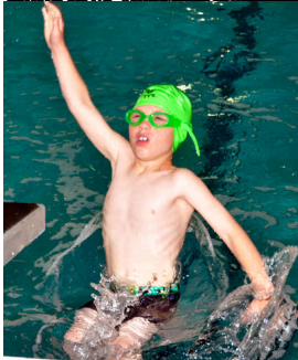
starts the girls' 11-12 25 yd. backstroke