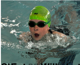
swims breaststroke during the girls' 11-12 100 yd. individual medley