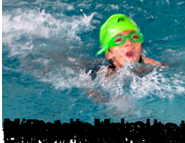
swims butterfly through the last 25 yd. of the 100 yd. individual medley