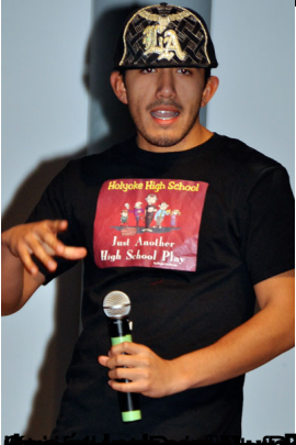
title. This is the A Christmas Carol, which is the first of the series. The play is