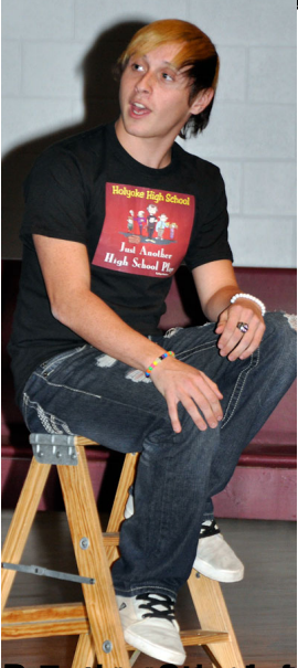
Dr. Todd says that the show is a little more of a ride, and a unique HHS. Through a puppet show